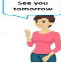
See you tomorrow