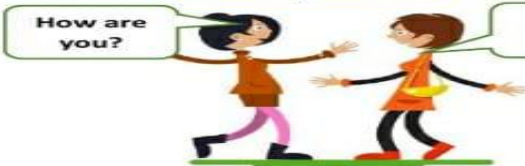
How are you?