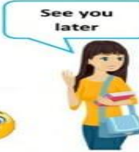
See you later