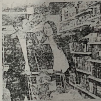
5. They're shopping.