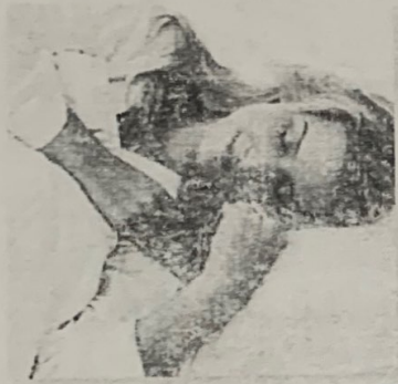
1. She's sleeping.