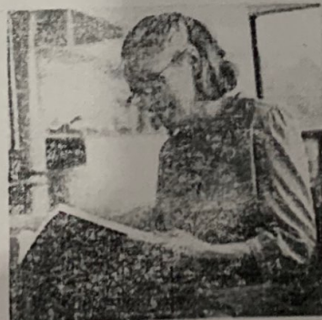
8. she's reading a book.