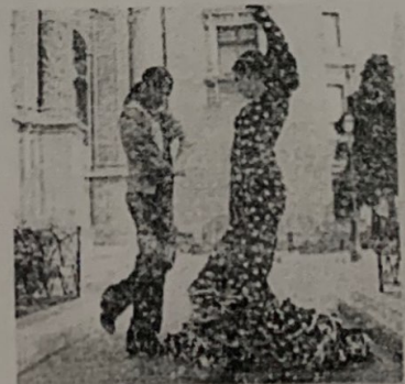
9. They're dancing.