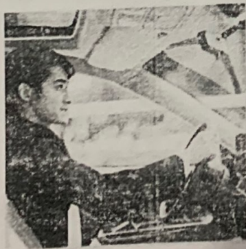
7. He's driving.