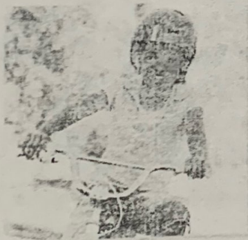
4. She's riding a bike.