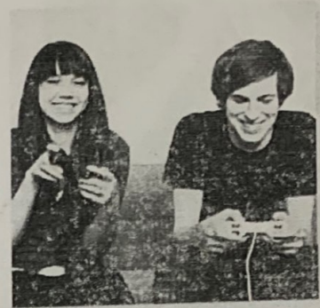
3. They're playing a video game.