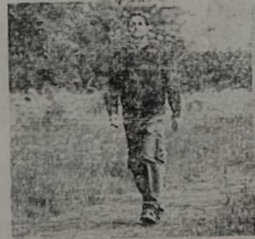
6. He's take a walking.