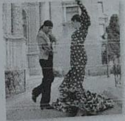
9. They're dancing