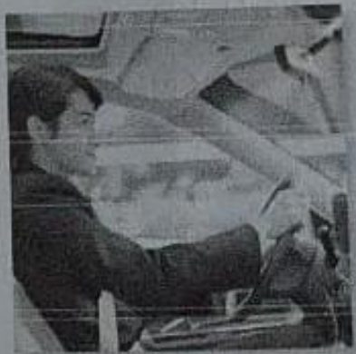
7. He's driving