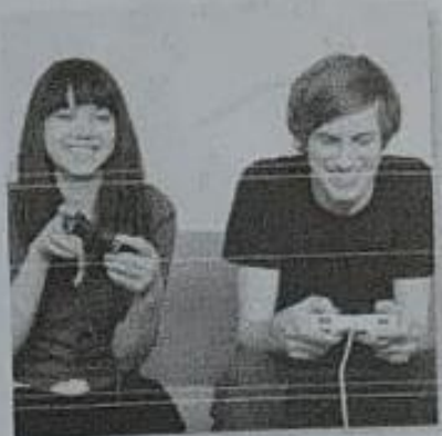
3. They're playing a video game