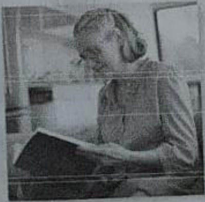
8. She's reading a book