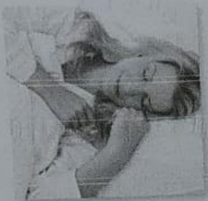
1. She's sleeping