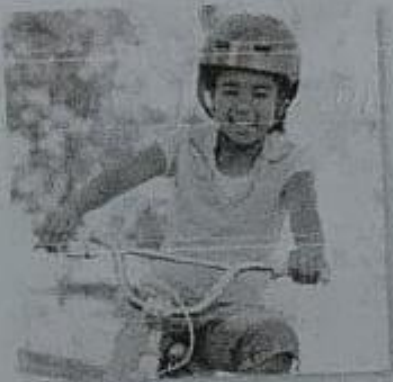
4. He's riding a bike