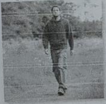
6. He's taking a walk