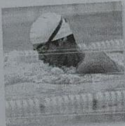
2. He's swimming