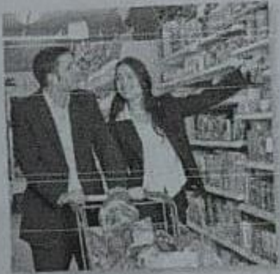
5. They're shopping