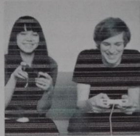
3. They're playing a video game.