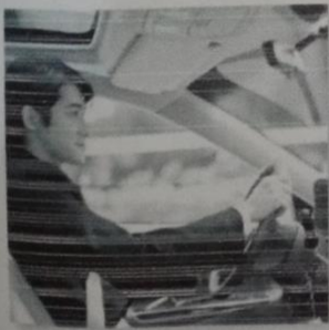
7. He's driving.