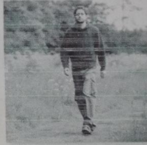
6. He's taking a walk.