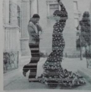
9. They're dancing.