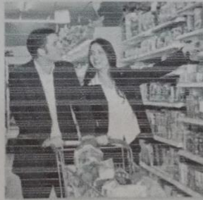
5. They're shopping.