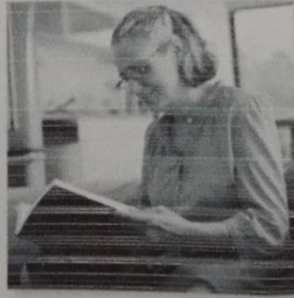
8. She's reading a book.