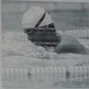
2. He's swimming.