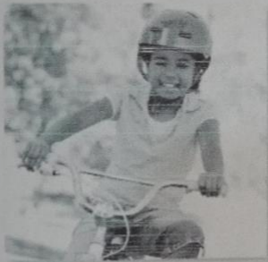
4. She's riding a bike.