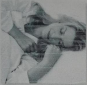
1. She's sleeping.