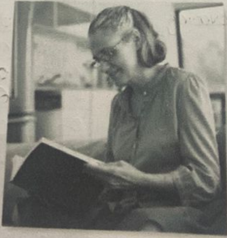
8. She's reading