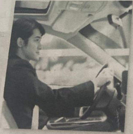
7. he's driving