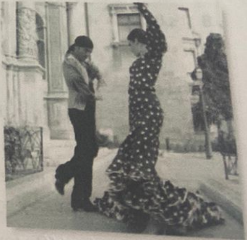
9. they're dancing