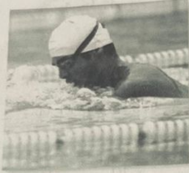
2. he's swimming