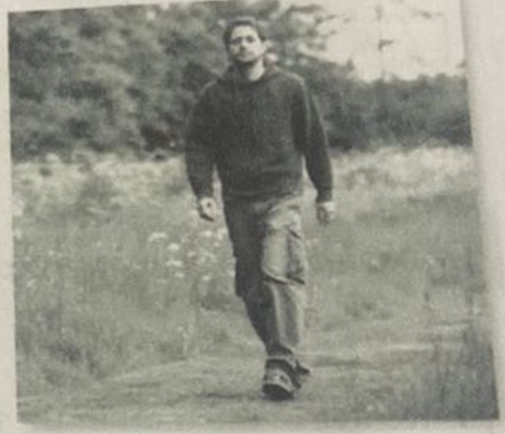
6. he's taking a walk