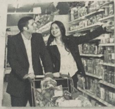
5. they're shopping