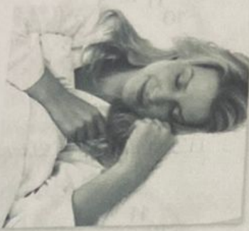
1. She's sleeping.