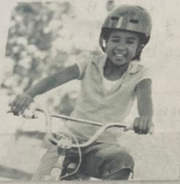
4. he's riding a bike