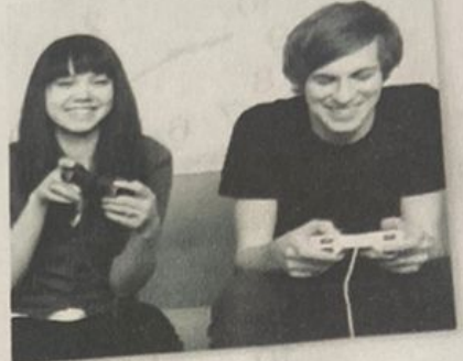
3. they're playing video games