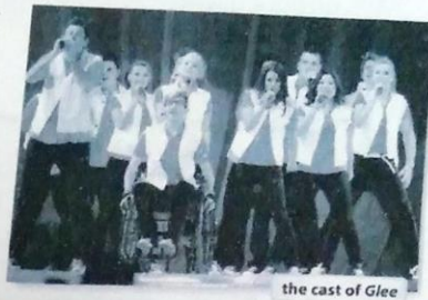
the cast of Glee