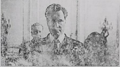
3. Colin Firth is an actor