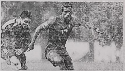
4. Nani is a soccer player