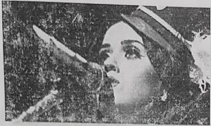
1. Katy Perry is a singer