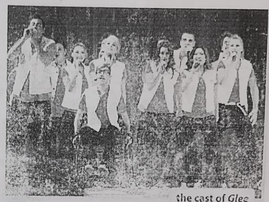
the cast of Glee