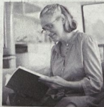
8. She's reading a book