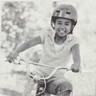
4. He's riding a bike