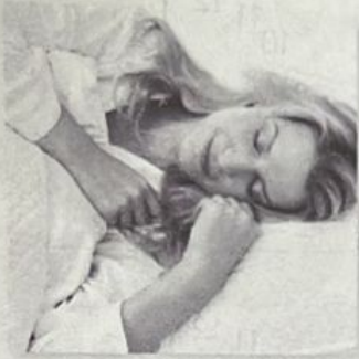
1. She's sleeping.