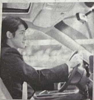
7. He's driving