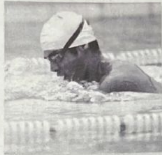
2. He's swimming