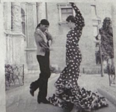
9. They are dancing