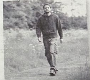
6. He's take a walking