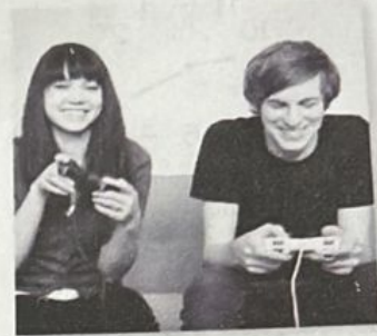
3. They are playing a video game