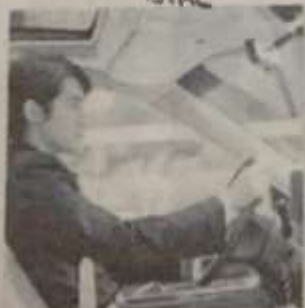
2. He is driving his car