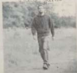
He is walking