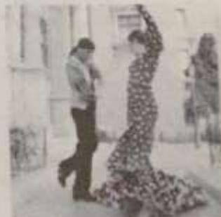
2. They are dancing