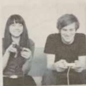
3. They are playing a video game