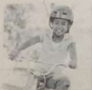
4. He is driving a bike