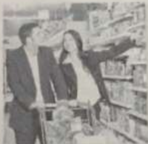
5. They are shopping