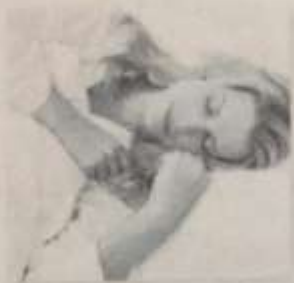
1. She is sleeping