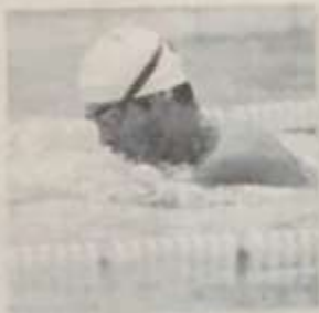
2. He is swimming