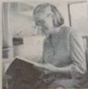
2. She is reading a book