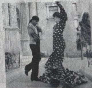
9. They're dancing.