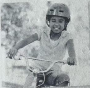
4. She's riding a bike.