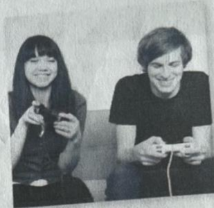
3. They are playing a video game.