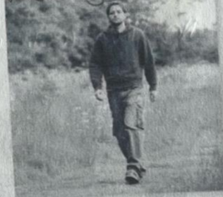
6. He's taking a walk.