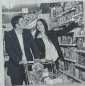
5. They are buying in the shop.