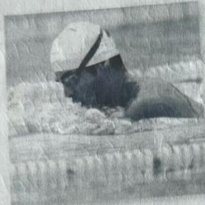
2. He is swimming.