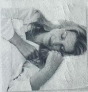
1. She's sleeping.