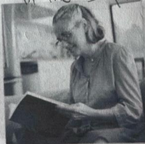
8. She's reading a book.