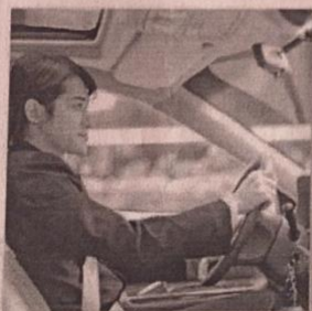
7. He's driving