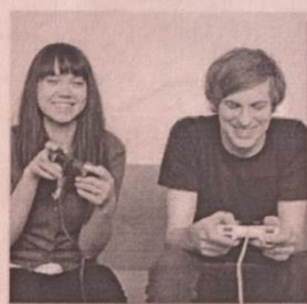
3. they are playing a video game