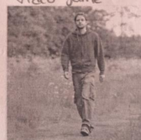
6. He's taking a walk