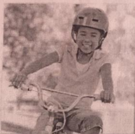
4. She's riding bicycle