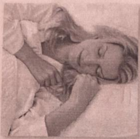
1. She's sleeping.