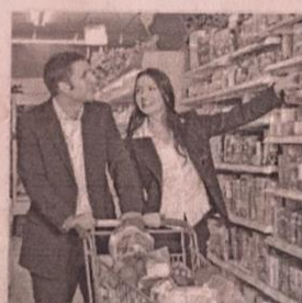
5. They are buying in the shop