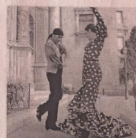
9. They're dancing