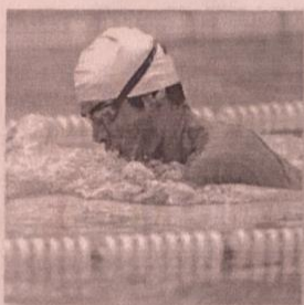
2. He is swimming