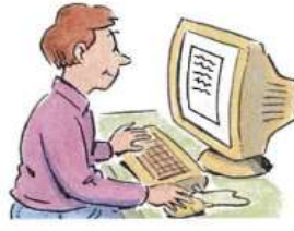
6. check e-mail