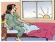
1. get up