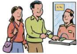
8. go to the movies