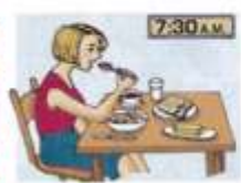
7. eat breakfast