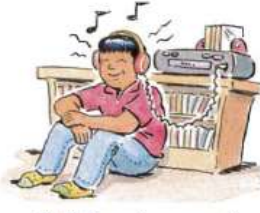
3. listen to music