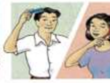
4. comb / brush my hair