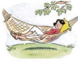
2. take a nap