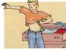
2. get dressed