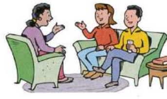
10. visit friends