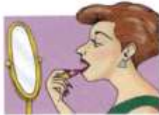
6. put on makeup