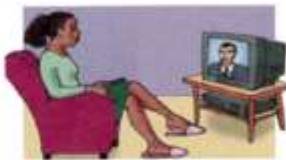
11. watch TV