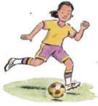
5. play soccer