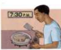
9. make dinner