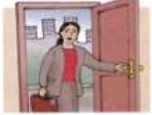
8. come home