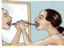
3. brush my teeth