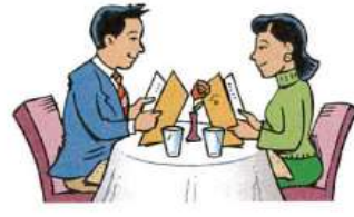
7. go out for dinner