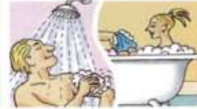
13. take a shower / a bath