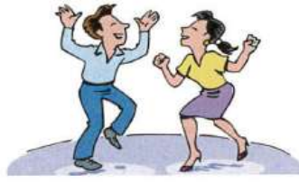
9. go dancing