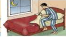
14. go to bed