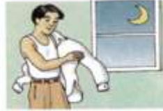
12. get undressed