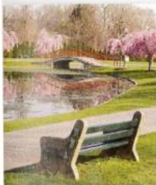
4. a park