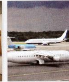
7. an airport