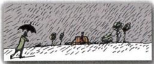
4. It`s raining.