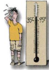
6. It`s hot.