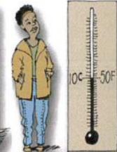
9. It`s cool.

Exercise 1. Translate the vocabulary. (Traduce el vocabulario de la parte de arriba)