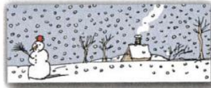
5. It`s snowing.