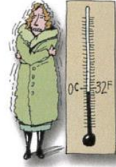
7. It`s cold.