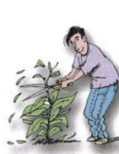
8. It`s warm.