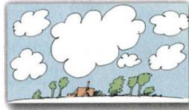
2. It`s cloudy.