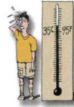
6. It`s hot.