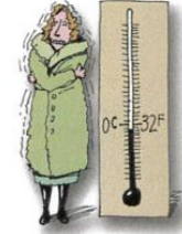
7. It`s cold.