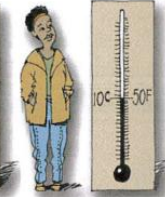
9. It`s cool.