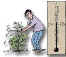
8. It`s warm.