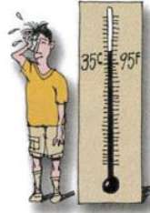
6. It's hot.