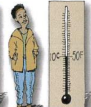
9. It's cool.

Exercise 1. Translate the vocabulary. (Traduce el vocabulario de la parte de arriba)