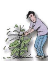
8. It's warm.