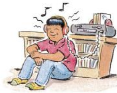
3. listen to music