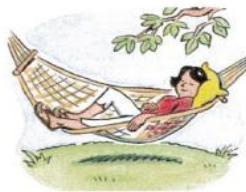
2. take a nap