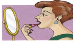
6. put on makeup