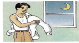
12. get undressed