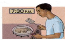
9. make dinner