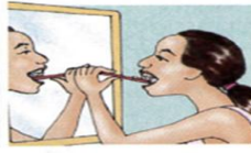
3. brush my teeth