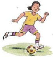
5. play soccer