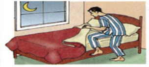
14. go to bed