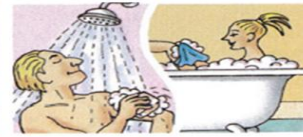
13. take a shower / a bath