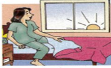
1. get up