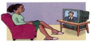
11. watch TV