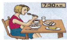
7. eat breakfast