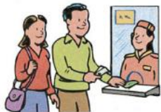
8. go to the movies