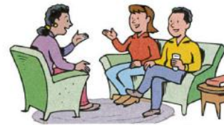
10. visit friends