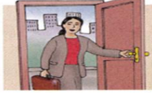
8. come home