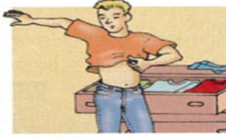
2. get dressed