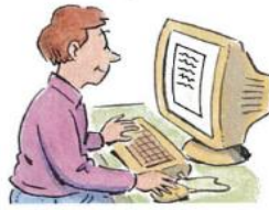
6. check e-mail