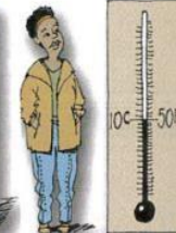
9. It's cool.

Exercise 1. Translate the vocabulary. (Traduce el vocabulario de la parte de arriba)