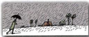
4. It's raining.