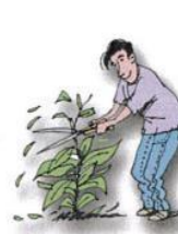
8. It's warm.