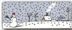
5. It's snowing.