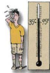
6. It's hot.