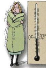
7. It's cold.