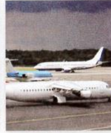
7. an airport