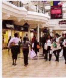
5. a mall