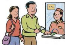
8. go to the movies