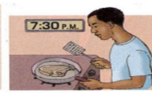
9. make dinner