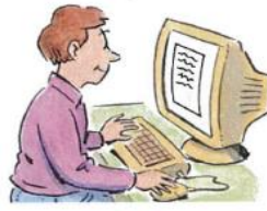
6. check e-mail