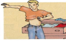
2. get dressed