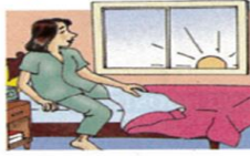
1. get up