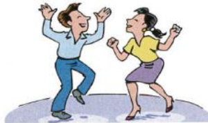
9. go dancing