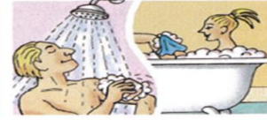
13. take a shower / a bath