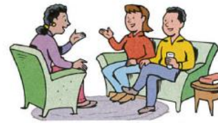
10. visit friends