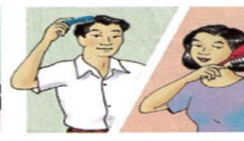
4. comb / brush my hair