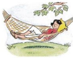
2. take a nap