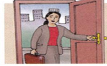
8. come home