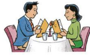
7. go out for dinner