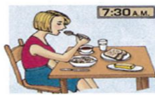
7. eat breakfast