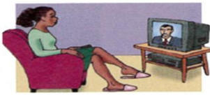
11. watch TV