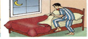
14. go to bed