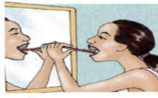
3. brush my teeth