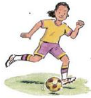
5. play soccer