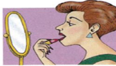
6. put on makeup