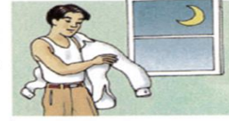
12. get undressed