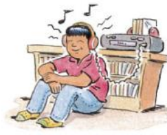
3. listen to music