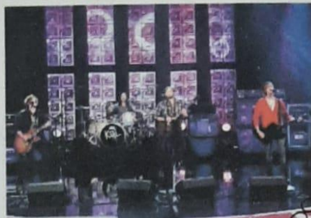
Kings of Leon