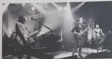
2. The Kings of Leon are a rock band