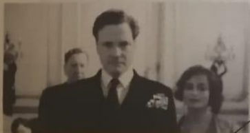
3. Colin Firth is an actor