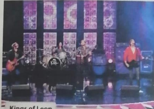
Kings of Leon