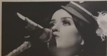
1. Katy Perry is a Singer