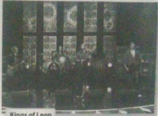
Kings of Leon