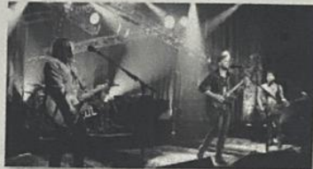
2. The Kings of Leon are a rock band