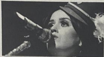
1. Katy Perry is a singer