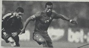
4. Nani is a soccer player