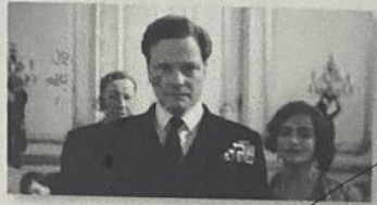
3. Colin Firth is an actor