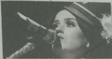
1. Katy Perry is a singer