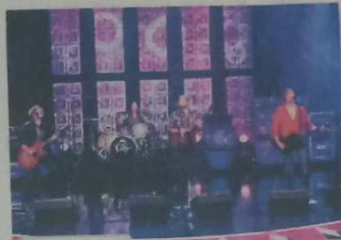
Kings of Leon