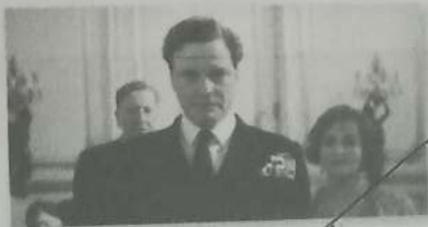
3. Colin Firth is an actor