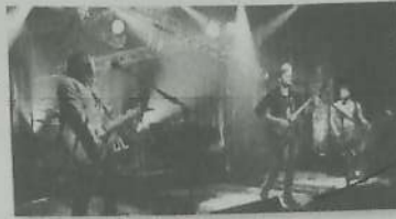
2. The Kings of Leon are a rock band