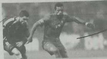
4. Nani is a soccer player