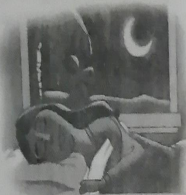
Los Angeles 4:00 A.M.