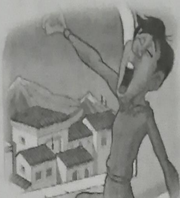
Mexico City 6:00 A.M.