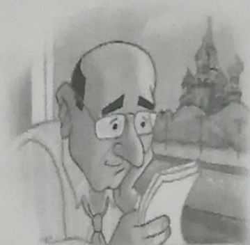
Moscow 3:00 P.M.

What are Jim and Ann doing? It's noon, so they're eating lunch.