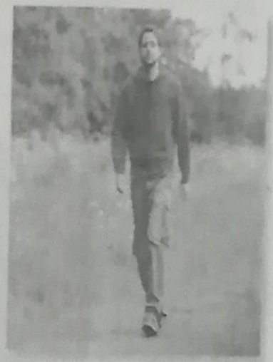
6. He is walking