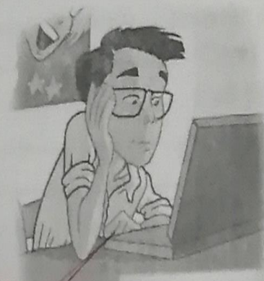
Tokyo 9:00 P.M.