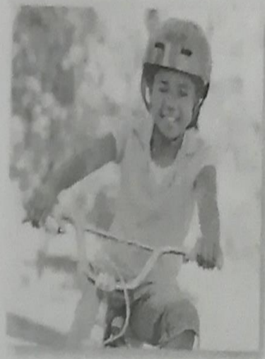
4. She is riding