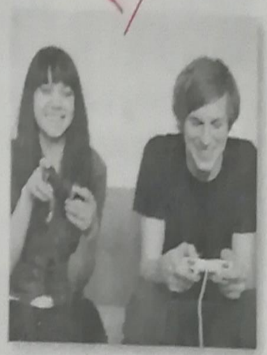
3. They are playing