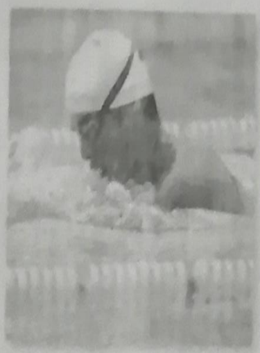
2. He IS swimming