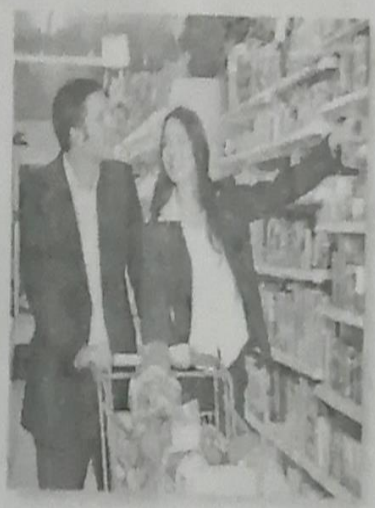
5. They are shopping