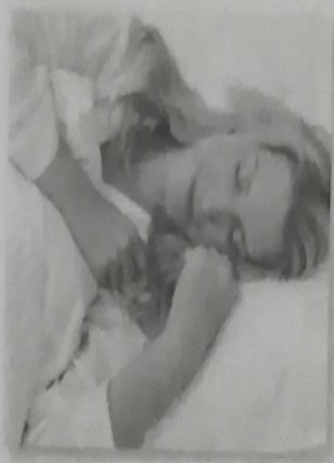
1. She's sleeping.