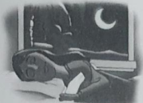
Los Angeles 4:00 A.M.