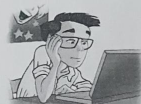
Tokyo 9:00 P.M.