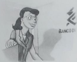
Brasilia 9:00 A.M.