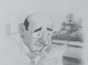
Moscow 3:00 P.M.

What are Jim and Ann doing? It's noon, so they're eating lunch .