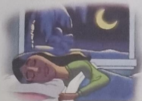
Los Angeles 4:00 A.M.