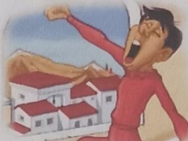
Mexico City 6:00 A.M.