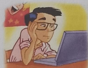
Tokyo 9:00 P.M.