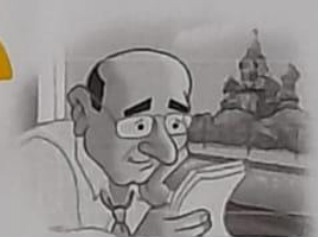
Moscow 3:00 P.M.

What are Jim and Ann doing? It's noon, so they're eating lunch.