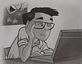
Tokyo 9:00 P.M.