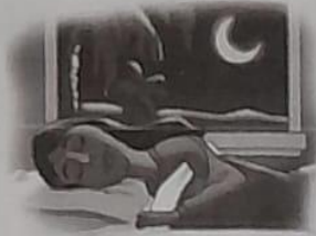
Los Angeles 4:00 A.M.