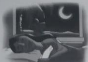
Los Angeles 4:00 A.M.