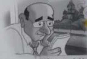
Moscow 3:00 P.M.

What are Jim and Ann doing? It's noon, so they're eating lunch.