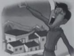
Mexico City 6:00 A.M.