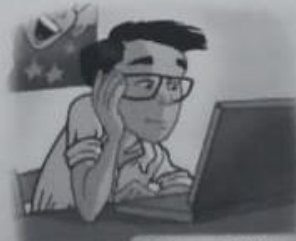
Tokyo 9:00 P.M.