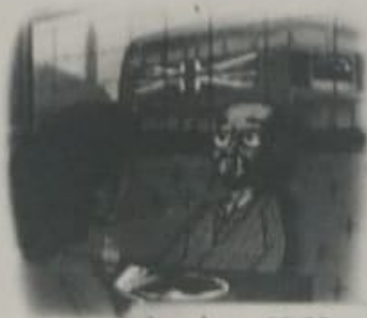
London 12:00 noon