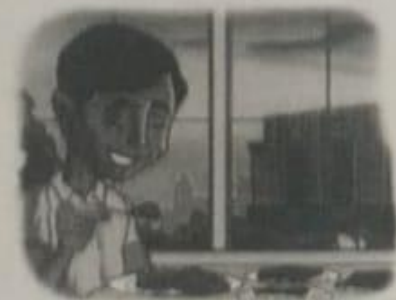
Bangkok 7:00 P.M.