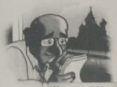
Moscow 3:00 P.M.