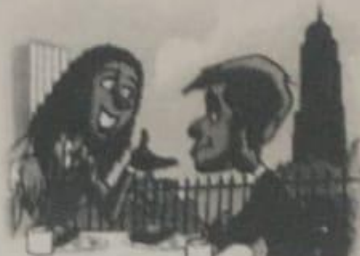
New York City 7:00 A.M.

3 What's Victoria doing? She's sleeping right now.