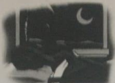
Los Angeles 4:00 A.M.