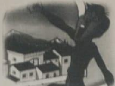
Mexico City 6:00 A.M.