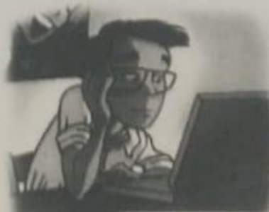
Tokyo 9:00 P.M.