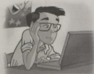
Tokyo 9:00 P.M.