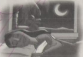
Los Angeles 4:00 A.M.