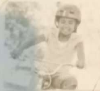
4. She's riding a bike