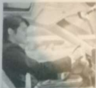
7. She's dancing