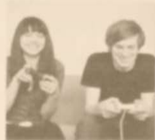
3. They are playing a video game