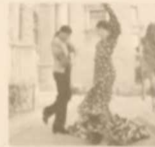
9. They are dancing