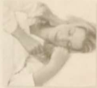
1. She's sleeping