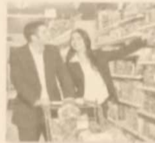
5. They are shopping