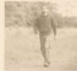
6. He's taking a walk