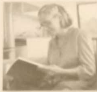
8. She's reading a book