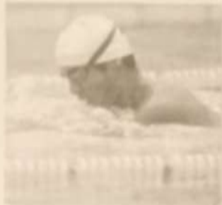
2. He's swimming