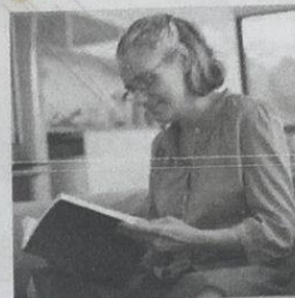
8. SHE IS READING A BOOK