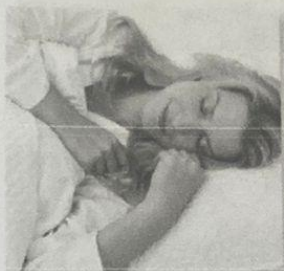
1. She's sleeping.