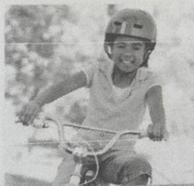
4. SHE'S RIDING A BIKE