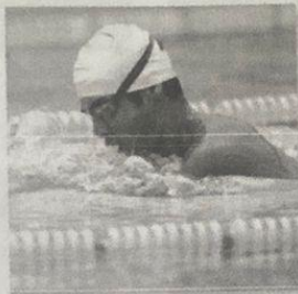
2. HE IS SWIMMING