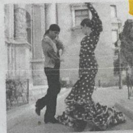
9. THEY ARE DANCING