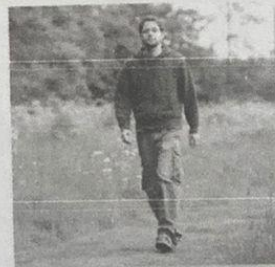
6. HE IS DRIVING