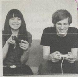
3. THEY ARE PLAYING A VIDEO GAME