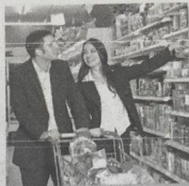
5. THEY ARE SHOPPING