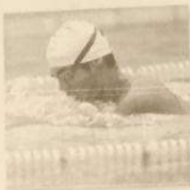
2. HE'S SWIMMING