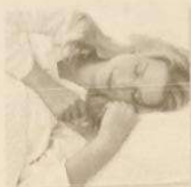
1. She's sleeping