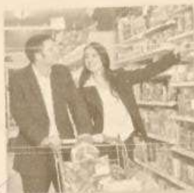
5. THEY ARE SHOPPING