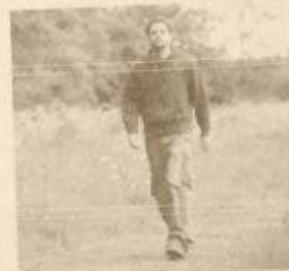
6. HE'S TAKING A WALK