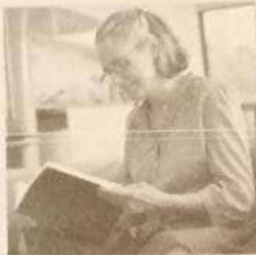
8. SHE'S READING A BOOK