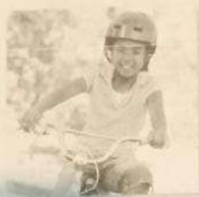
4. SHE'S RIDING A BIKE