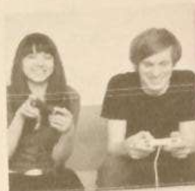
3. THEY ARE PLAYING A VIDEO GAME