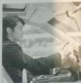
7. HE'S DRIVING