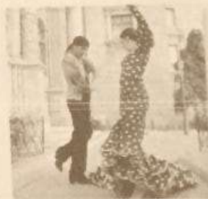
9. THEY ARE DANCING