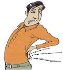
5. a backache