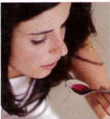
1. take something