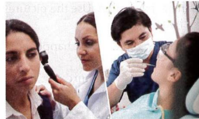
4. see a dcotor/ see a dentist