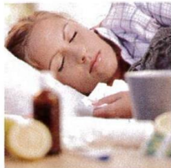
2. lie down