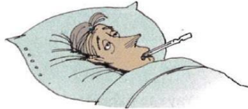
8. a fever