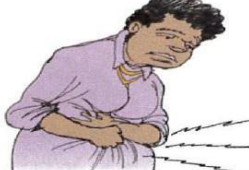
2. a stomachache