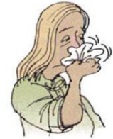
10. a runny nose

Exercise 2. Translate to Spanish the vocabulary above. Traduce al español el vocabulario de arriba.