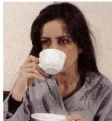
3. have some tea