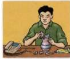
12. fix things

Exercise 1. Translate to Spanish the vocabulary above. Traduce al español el vocabulario de arriba.