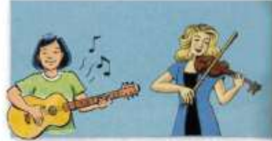
4. play the guitar/ the violin