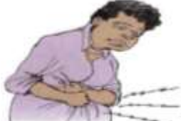
2. a stomachache