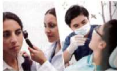
4. see a doctor/ see a dentist