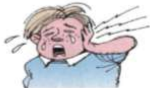
3. an earache