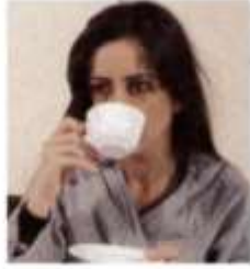
3. have some tea