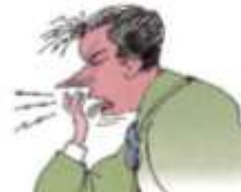
9. a cough