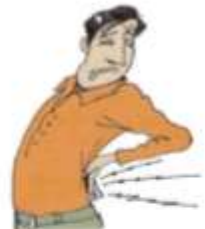
5. a backache