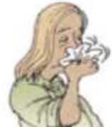
10. a runny nose

Exercise 2. Translate to Spanish the vocabulary above. Traduce al español el vocabulario de arriba.