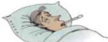
8. a fever