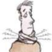
7. a sore throat