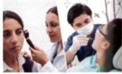
4. see a doctor/ see a dentist