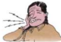
4. a toothache