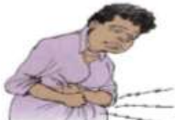
2. a stomachache