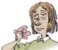
6. a cold