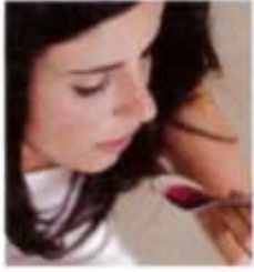
1. take something