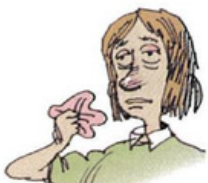
6. a cold