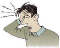
1. a headache