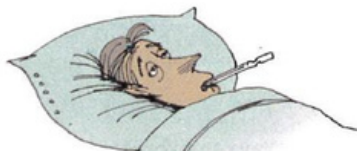
8. a fever