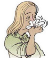
10. a runny nose

Exercise 2. Translate to Spanish the vocabulary above. Traduce al español el vocabulario de arriba.