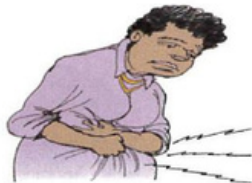
2. a stomachache