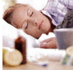
2. lie down