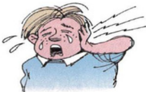
3. an earache