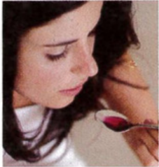
1. take something