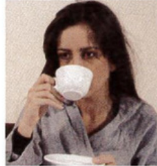
3. have some tea