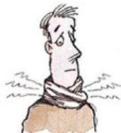
7. a sore throat