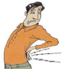
5. a backache