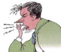
9. a cough