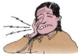
4. a toothache