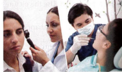
4. see a doctor/ see a dentist