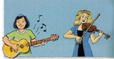
4. play the guitar/ the violin