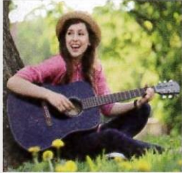
Carrie can play the guitar.

We use "can" or "can't" + the base form of a verb to talk about ability.