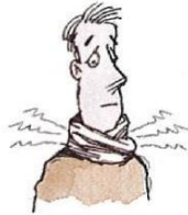
7. a sore throat