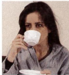
3. have some tea