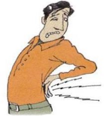
5. a backache