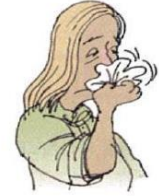
10. a runny nose

Exercise 2. Translate to Spanish the vocabulary above. Traduce al español el vocabulario de arriba.