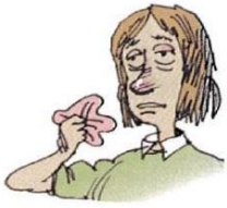
6. a cold