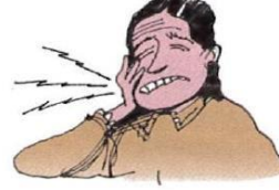
4. a toothache