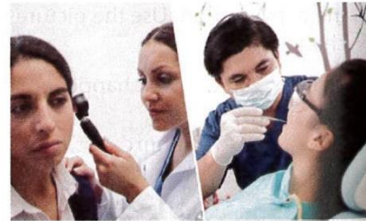
4. see a doctor/ see a dentist