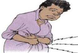
2. a stomachache