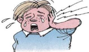
3. an earache