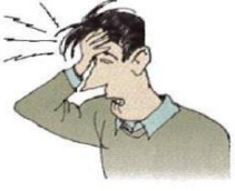
1. a headache