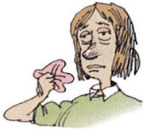
6. a cold