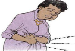
2. a stomachache