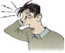
1. a headache