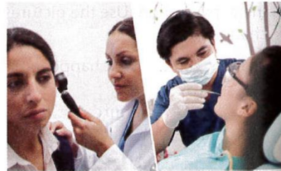
4. see a doctor/ see a dentist