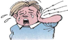
3. an earache