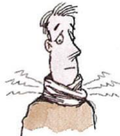
7. a sore throat