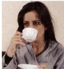
3. have some tea