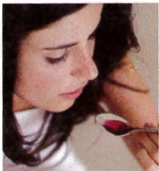
1. take something