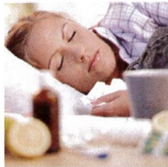
2. lie down