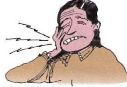
4. a toothache