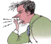
9. a cough