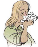
10. a runny nose

Exercise 2. Translate to Spanish the vocabulary above. Traduce al español el vocabulario de arriba.