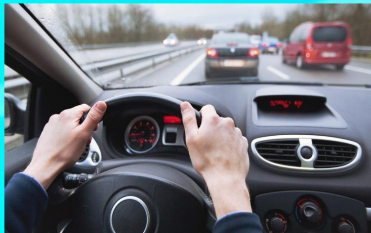
4.- I can drive very well