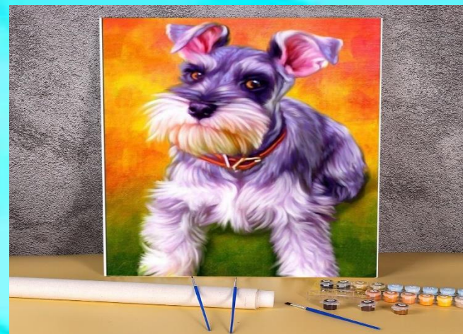
5.- I can paint pretty