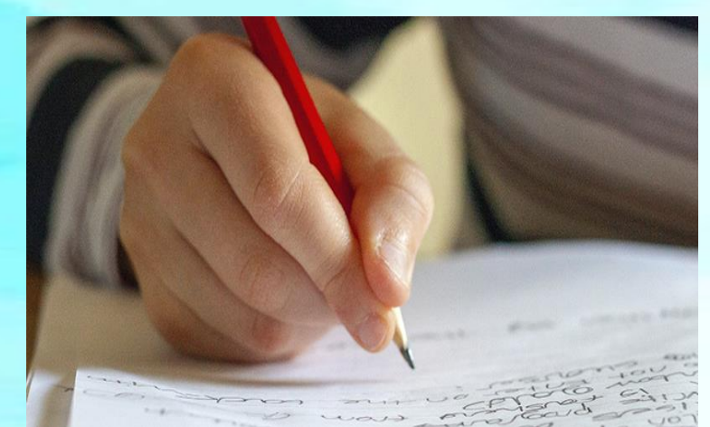
7.- I can write fast