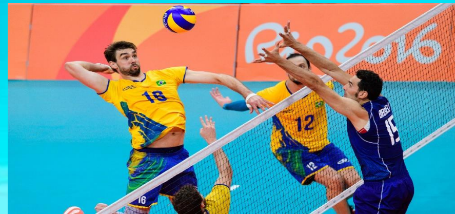
2.- I can play volleyball well