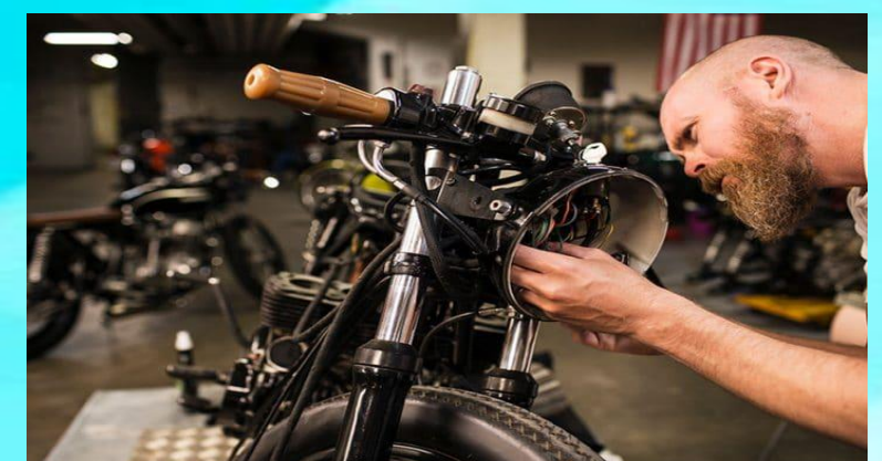
3.- I can fix a motorcycle