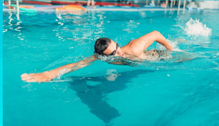
1.- I can swim very fast