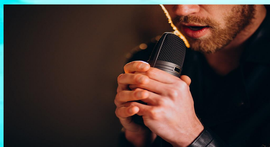
9.- I can sing