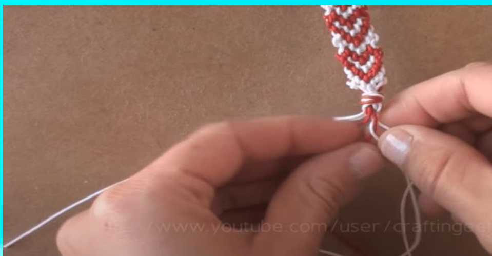
8.- I can make bracelets