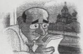
Moscow 3:00 P.M.

What are Jim and Ann doing? It's noon, so they're eating lunch.