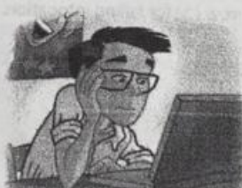
Tokyo 9:00 P.M.