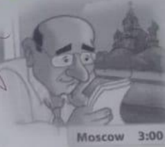
Moscow 3:00 P.M.

What are Jim and Ann doing? It's noon, so they're eating lunch.