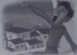
Mexico City 6:00 A.M.