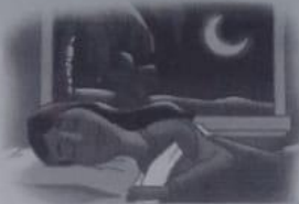
Los Angeles 4:00 A.M.