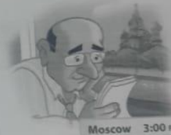
Moscow 3:00 P.M.

What are Jim and Ann doing? It's noon, so they're eating lunch.