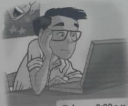
Tokyo 9:00 P.M.