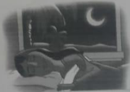
Los Angeles 4:00 A.M.