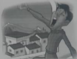
Mexico City 6:00 A.M.