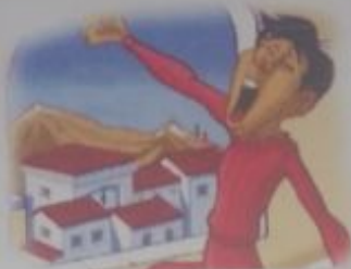
Mexico City 6:00 A.M.