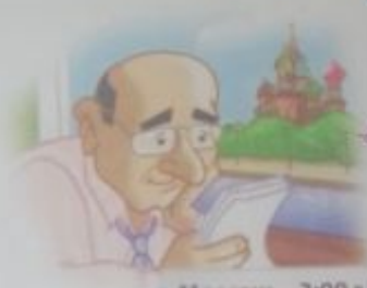
Moscow 3:00 P.M.

What are Jim and Ann doing? It's noon, so they're eating lunch.