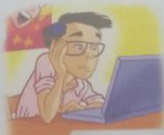
Tokyo 9:00 P.M.