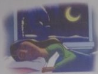
Los Angeles 4:00 A.M.