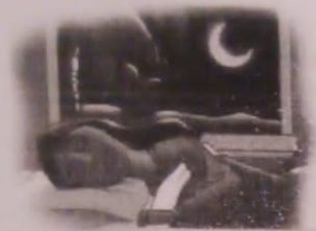
Los Angeles 4:00 A.M.