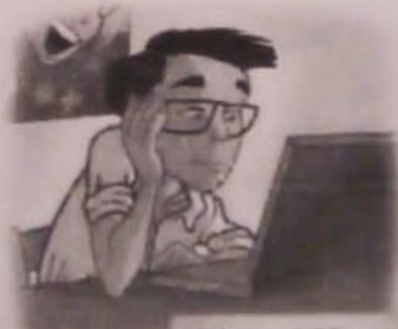
Tokyo 9:00 P.M.