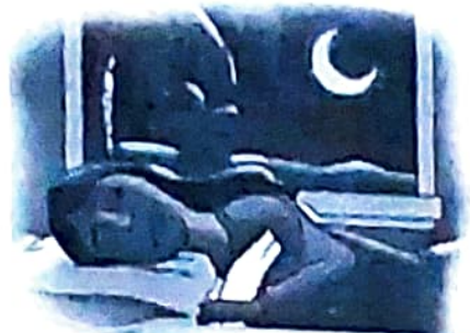
Los Angeles 4:00 A.M.