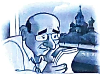
Moscow 3:00 P.M.

What are Jim and Ann doing? It's noon, so they're eating lunch.