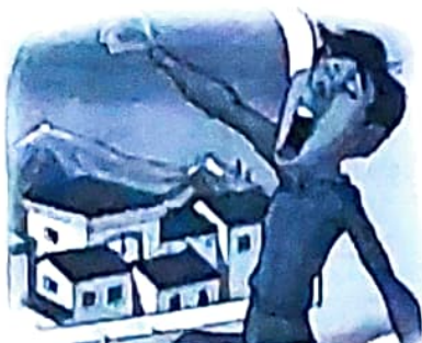
Mexico City 6:00 A.M.