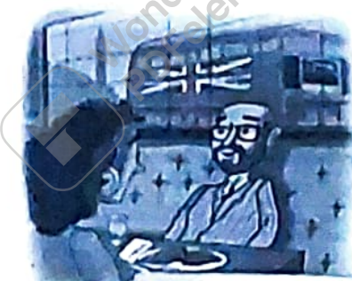
London 12:00 noon

What's C3l3a doing? She's going to work.